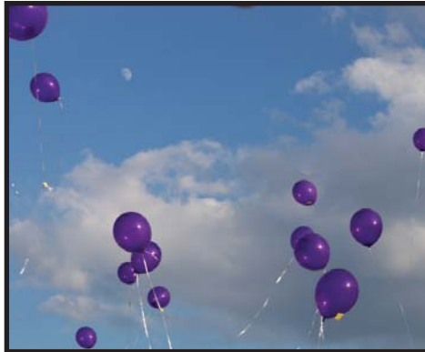
Balloons signifying September's "National Substance Abuse Awareness month"