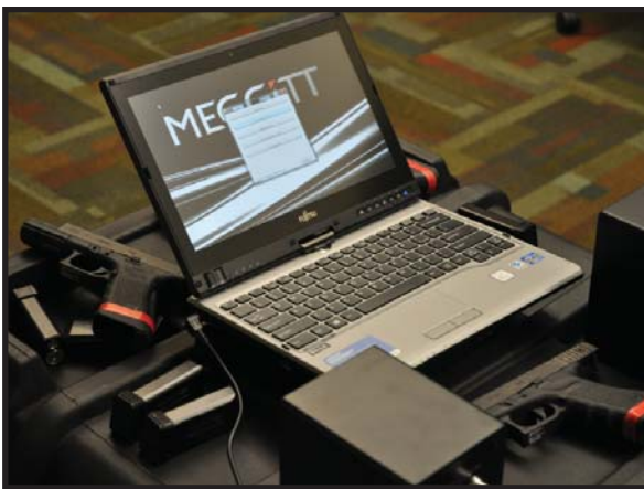
Meggitt CPU Pad and simulator weapons

On Sept. 13, the Department hosted a Firearms Simulator event to celebrate its new partnership with Georgia-based company, Meggitt Training Systems.