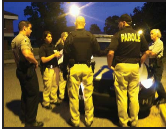
Officers out on the streets of Augusta serving warrants and conducting compliance checks