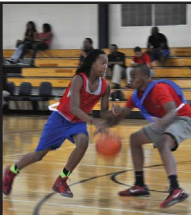
Snapshots from select age group games before championship game