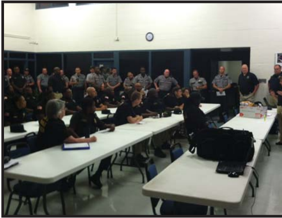
Probation, Parole and Local law enforcement officers at Command Center